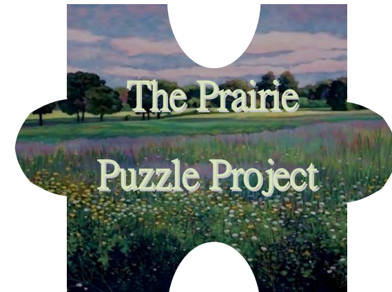
Exhibit at Windhover Center July 15 through September 16

The Prairie Puzzle Project is an exhibition and competition of art work in all mediums except photography that depicts prairie landscape scenes from the Fond du Lac County area. A winning piece will be selected that will be remade into a puzzle. The Puzzle will be sold publicly and proceeds will support the Gottfried Prairie and Arboretum.