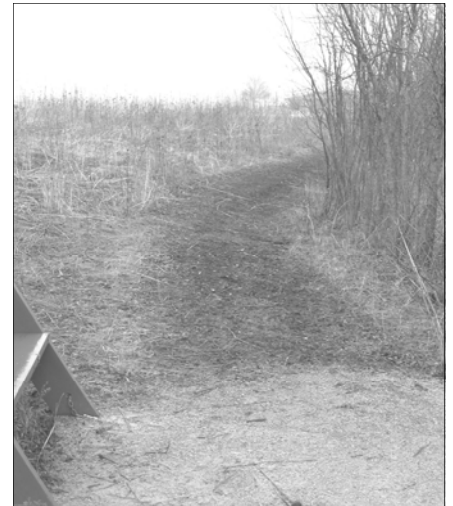
The trails restoration project will provide for resurfacing our present trail through the Arboretum, and complete a loop around the pond.

Recently the Arboretum received a grant from the Department of Natural Resources to revitalize our gravel trail that runs through the formal Arboretum. The grant will also provide funding to connect a loop of the trail around the pond, as well as create and install informational signage in the picnic shelter at the south end of the trail, and through the formal Arboretum. The total project cost is approximately $10,000. We plan to complete the restoration work during 2008. The DNR will provide a 50% match for the project, and we'll be asking the community for the balance of the funds. See above to find out how you can help.