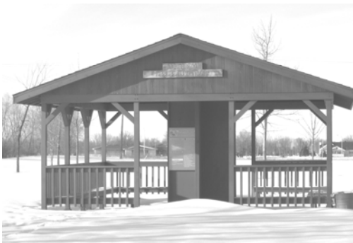
More signage will also be added to the picnic shelter.