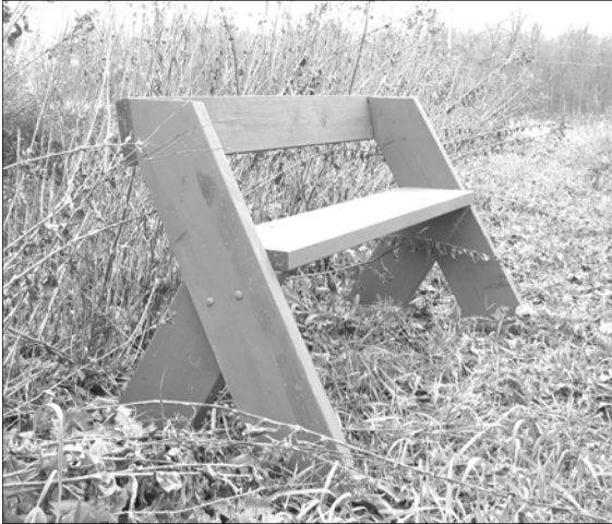
Leopold benches have a simple design and a classic look.

Now, you can support the Arboretum and do your holiday shopping at the same time. For $145, we'll install a handsome new "Leopold" bench at the Arboretum (picture below) and affix a small plaque with a dedication message of your choice. A holiday card acknowledging your gift will be sent when we receive your form. Your gift will help finance our trails restoration project. Benches will be installed in the spring as we complete our project.